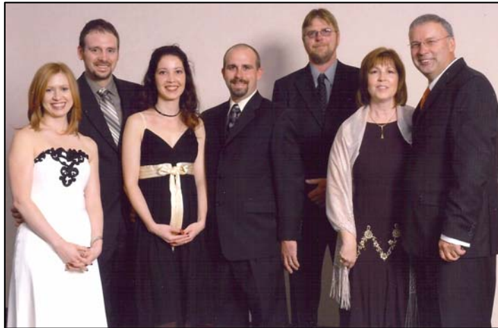
CotY Awards Gala in Austin, TX