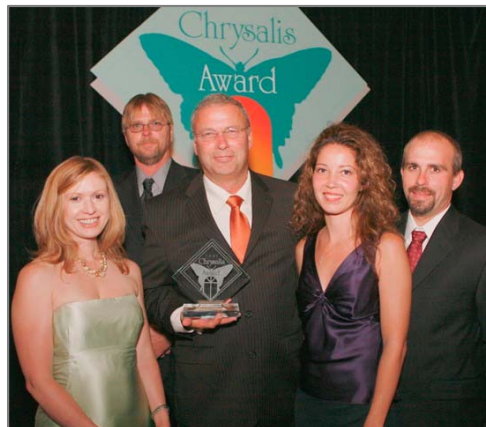
Chrysalis Awards Gala in Atlanta, GA